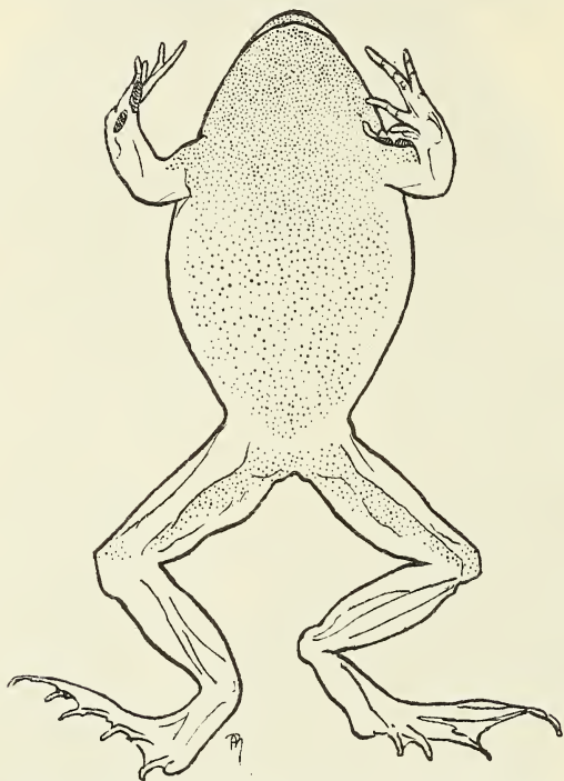
Text Fig. 3. Male Rana labrosa , Cope, showing asperities on ventral surface and on thumb.

To the characters cited by Mocquard (11, p. 104) by which R. labrosa may be distinguished from R. natalensis , Smith, namely the presence of a round tubercle near the tibio-tarsal joint, and the nature of the dorsal cutaneous folds, we are able to add another character to be found in the males during the breeding season, a character which is not repeated in R. natalensis . Scattered all over the ventral surface in the male there